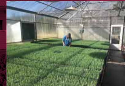
Reforestation America Page 12