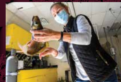
Forces of nature Page 20