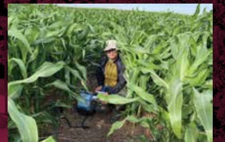
Capturing CO 2 Page 28