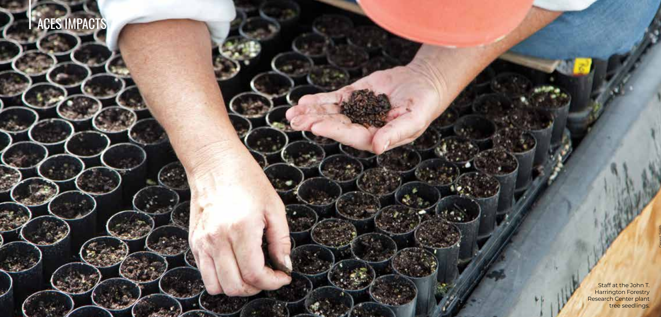
Staff at the John T. Harrington Forestry Research Center plant tree seedlings.