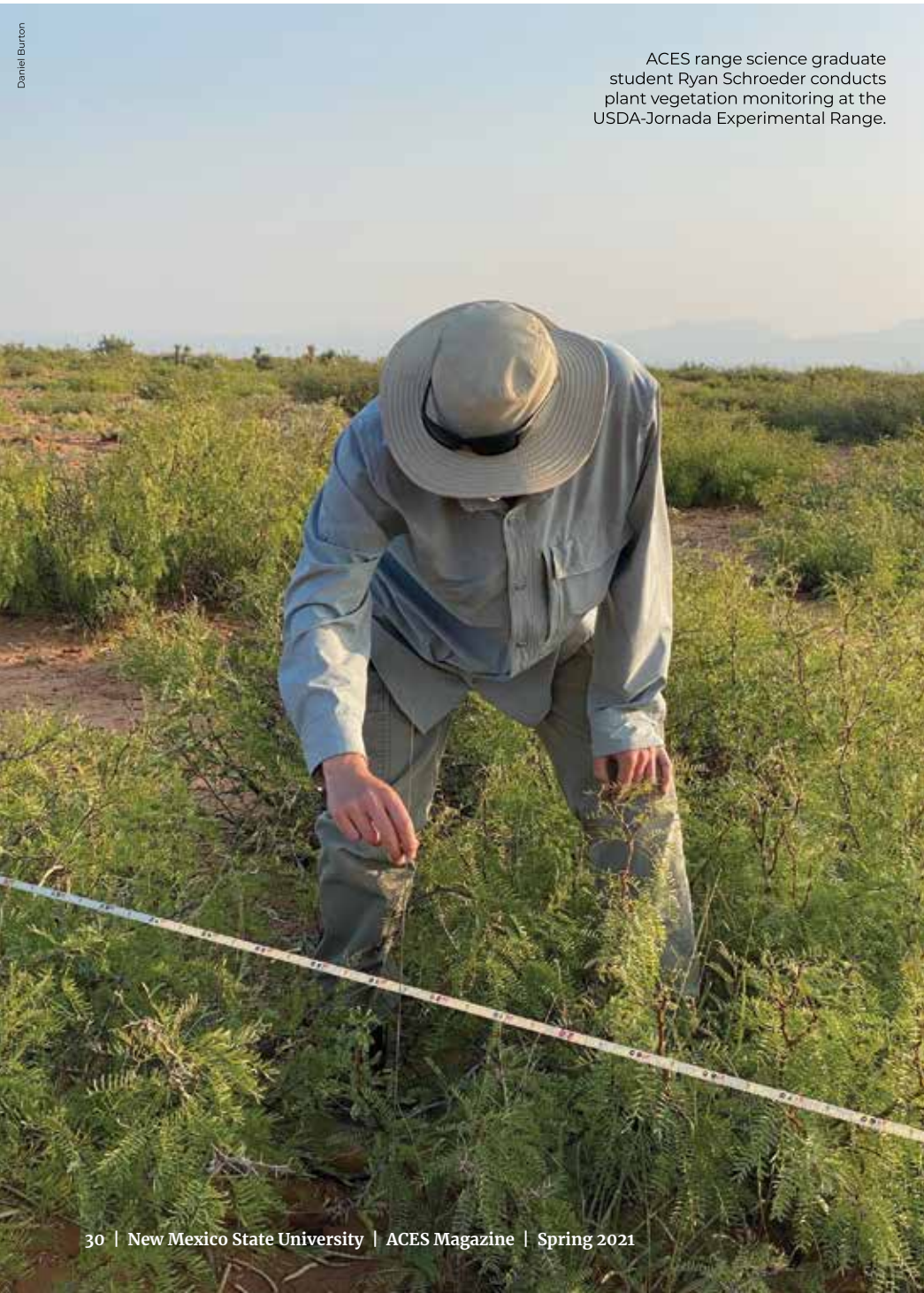
ACES range science graduate student Ryan Schroeder conducts plant vegetation monitoring at the USDA-Jornada Experimental Range.

in the atmosphere to vegetation and woody biomass and ultimately to the soil. The second part is minimizing loss of carbon already stored in vegetation or soil,” Ghimire said. “Both components are important to increase carbon storage for food production benefits and climate change mitigation.”