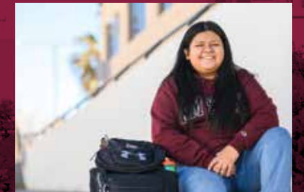
Home away from home Page 16