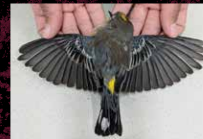
Avian alarm Page 26