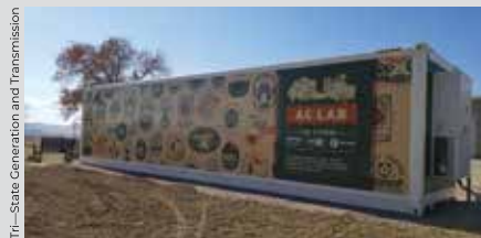
Tri-State Generation and Transmission

The NMSU Center of Excellence in Sustainable Food and Agricultural Systems has partnered with Tri-State Generation and Transmission to join the Electric Power Research Institute’s National Demonstration and Monitoring of Indoor Food Production Facilities research project to explore indoor agriculture concepts.