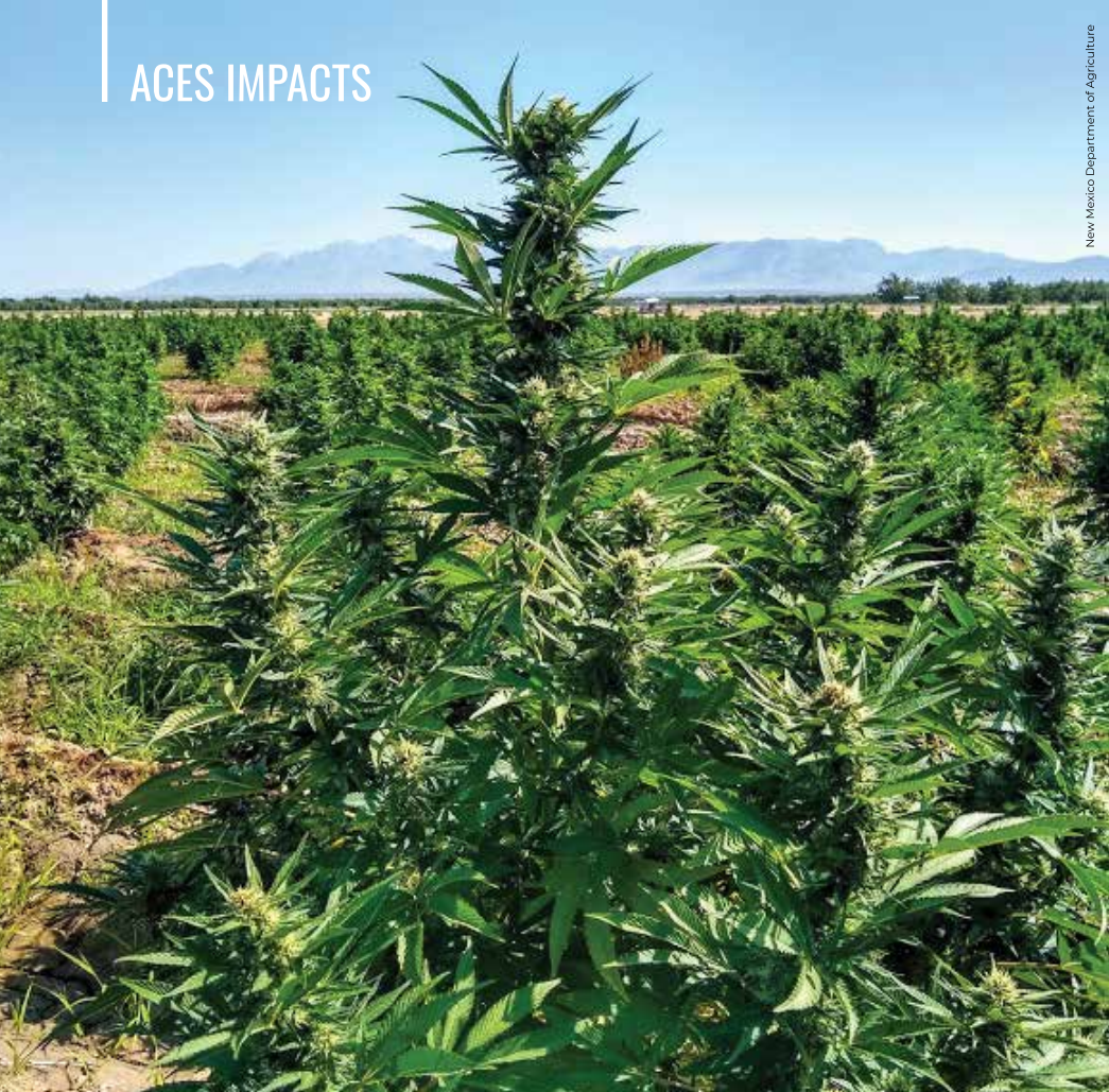
New Mexico Department of Agriculture